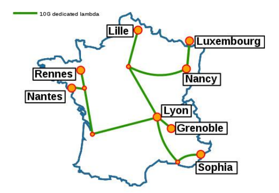
Figure 2. Geographic structure of the Grid5000 physical platform in France [8]

Li and his colleagues, have implemented a toolbased on CloudSim called DartCSim+that have ability to overcome the three CloudSim limitations using the changes they have made [19]. One of these limitations is not considering network overhead on the process of virtual machines live migration. In Figure 3, the flow of data in such a migration, based on the results that are reported by Li and colleagues [19] is depicted.