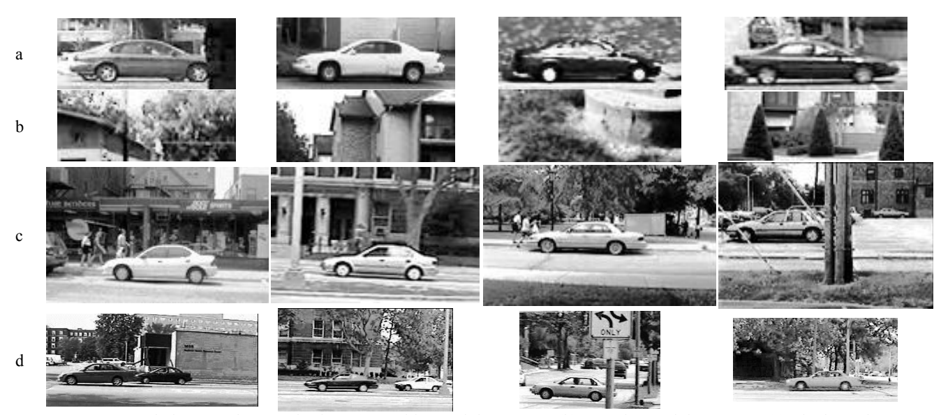
Figure 3. Sample images of UIUC database (a) Positive Training Images (b) Negative Training Images (c) Single Scale Test Images (d) Multi scale Test Images