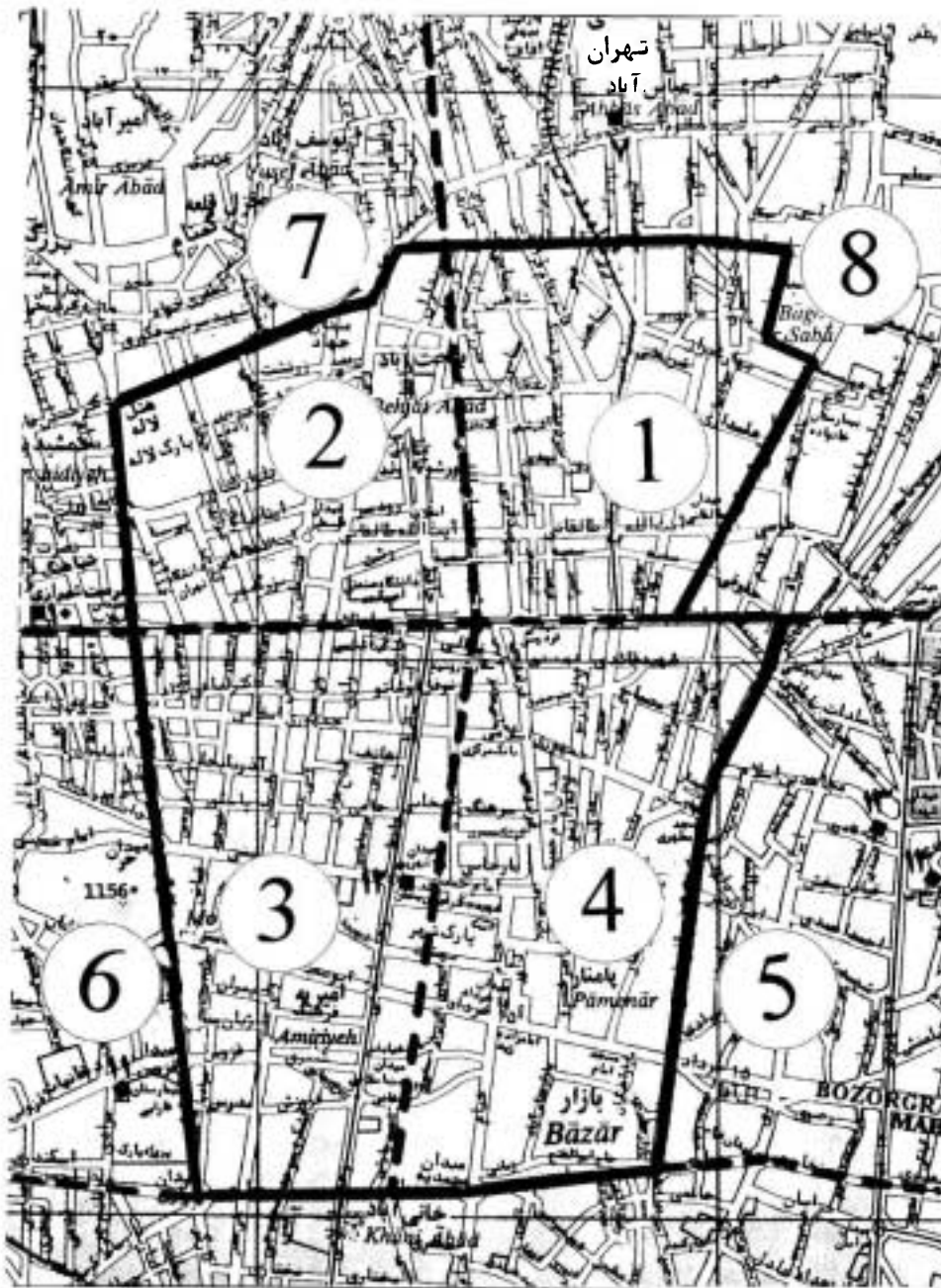
Figure 1. Study area map.

Data on each of the above features were collected for eight networks in and out of the Auto-Restricted Zone of Tehran (Figure 1). The quality of traffic